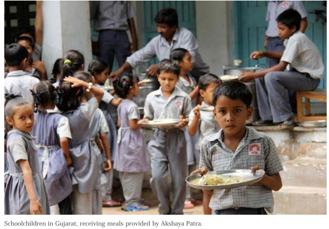
The Mid-Day Meal Scheme

hygiene products, three meals a day, and transportation. Fortunately, REAL youth to youth has stepped in to help. For the last three years, we have been providing aid to PPES, and fully intend to continue to do so. So please, help PPES prepare Indian women to challenge cultural expectations.