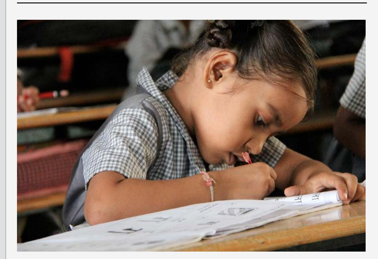
A second grader studiously does her work.

For many years, REAL has taken part in Portland's annual India Festival in Pioneer Courthouse Square. This year, our booth sold water, gave out balloon animals, and wrote people's names in many different Indian languages in henna. This festival was a great way for us to reach out to the community and present information to help spread the word about REAL and our mission to promote education and literacy all over the world.